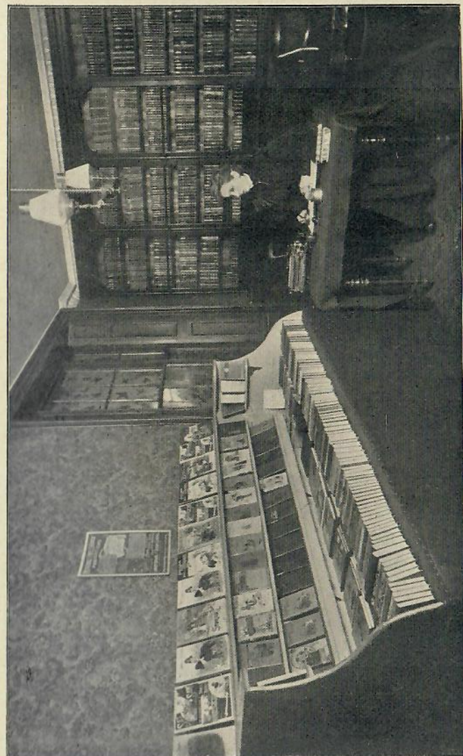
THE BOOK-ROOM, LONDON—REWARD-BOOK SALOON.

This Committee has varied somewhat in the number of its members. It is annually appointed by the Assembly. Until 1876, the retiring Committee nominated its successor; subject, of course, to alterations and additions. From 1877 to 1897, it consisted of the Editor, Book-Steward, and Treasurer, and ten other brethren elected by ballot from the London District. Now (1898) elections may be made from any District.